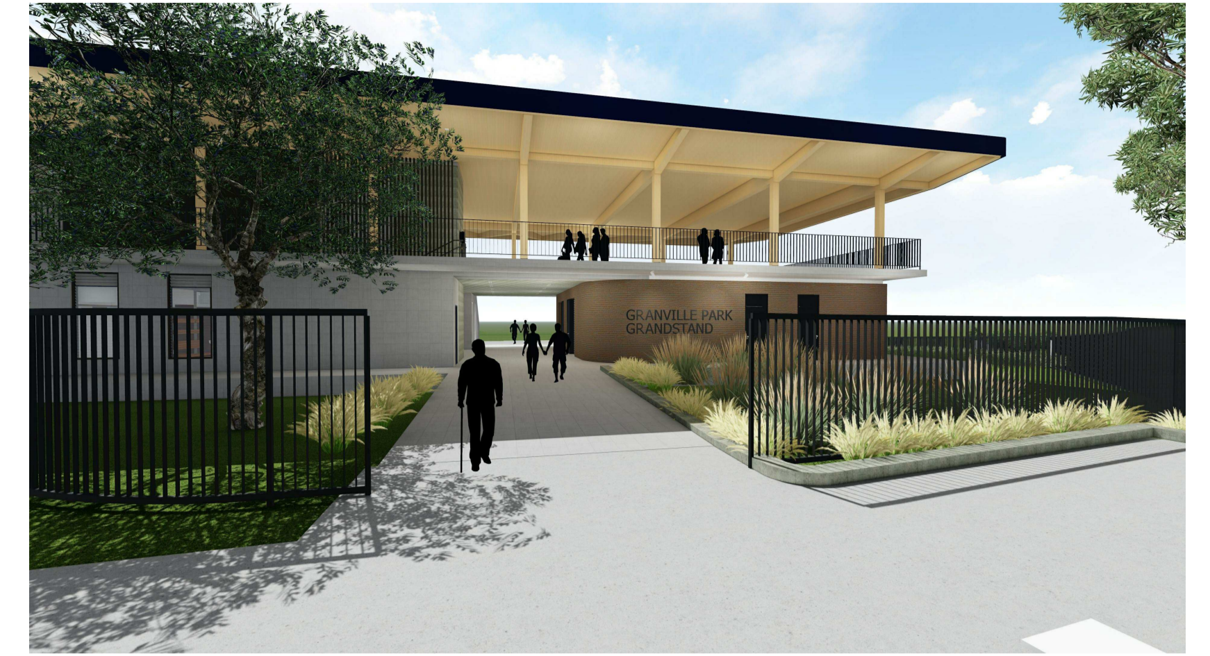
VIEW FROM CAR PARK