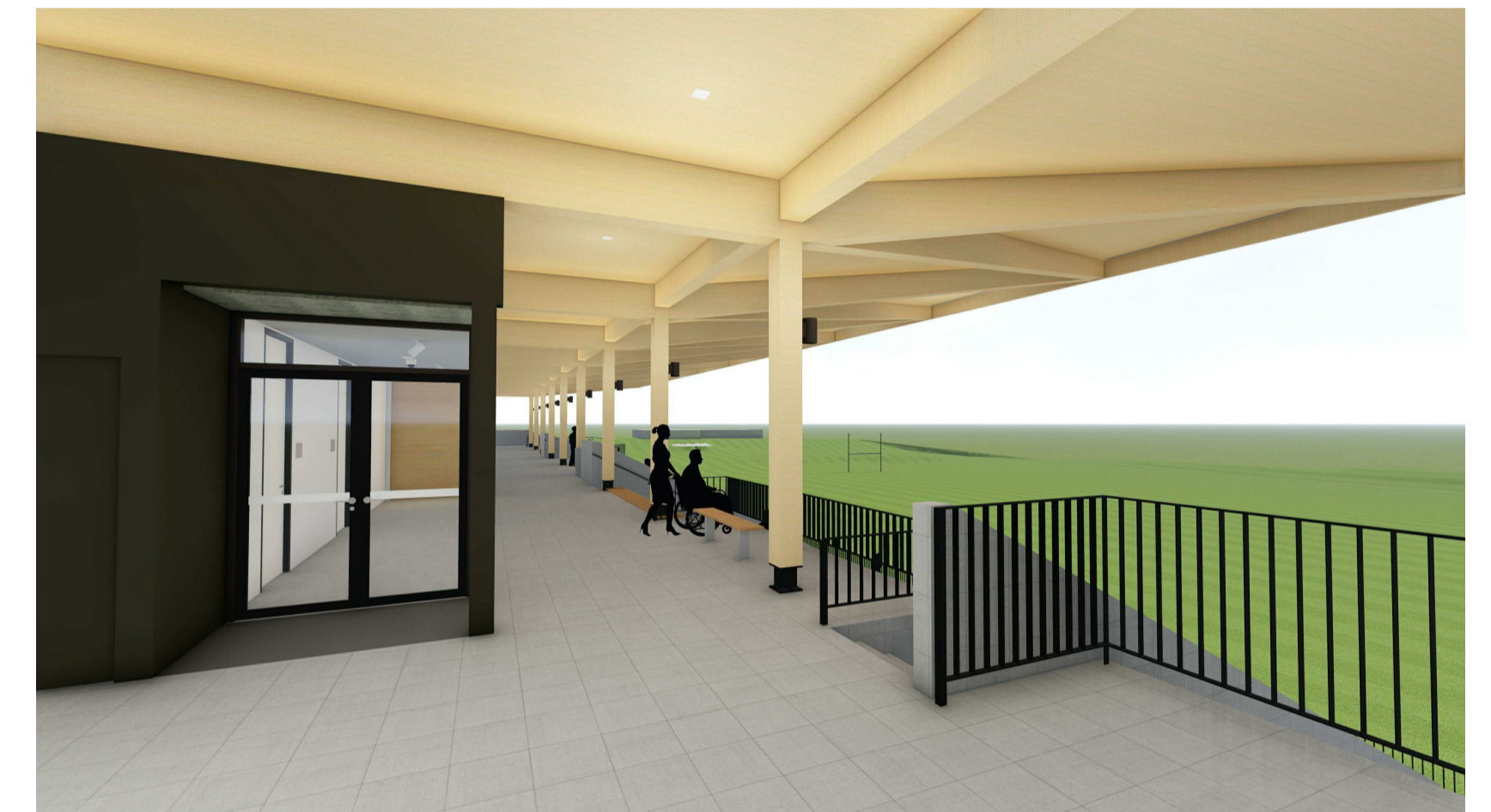
VIEW FROM VIEWING DECK