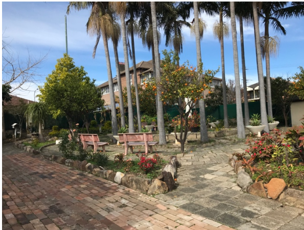
View of the convent building from the central garden