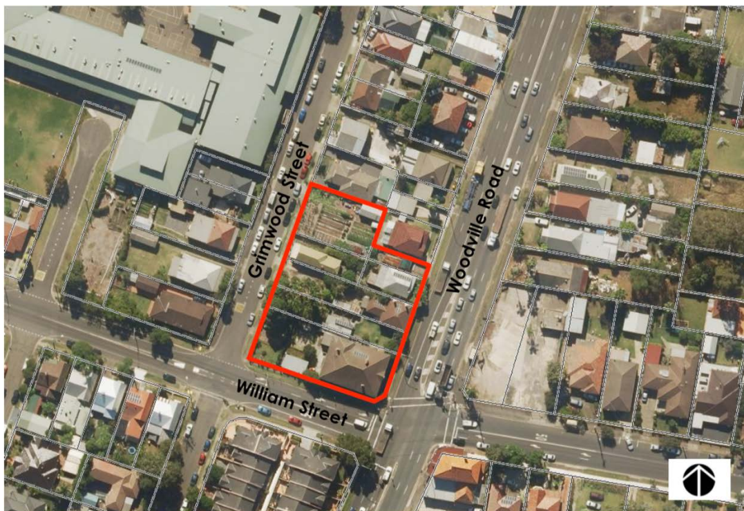
Figure 1 Location of proposed development site

The site also includes a well-cared for and extensive central garden with large palm trees, fruit trees and outdoor seating, as well as a large vegetable garden.