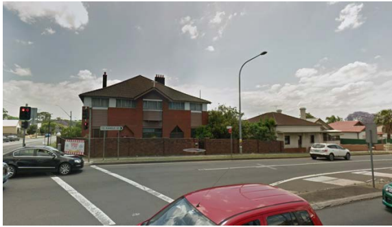
View of site from Woodville Rd / William St intersection