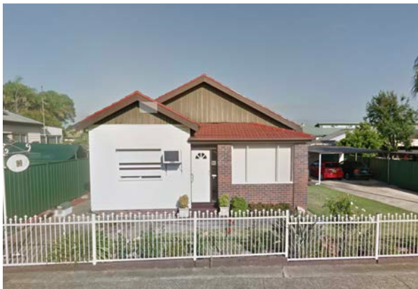
One-story residential dwelling adjacent to the site on Woodville Road