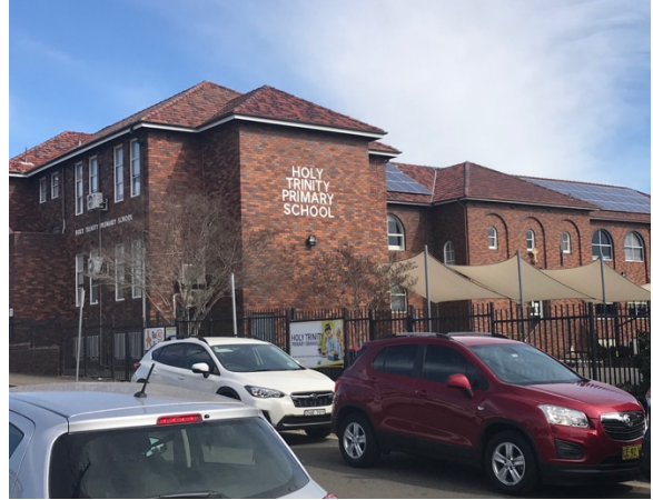
Holy Trinity Primary School on Grimwood St