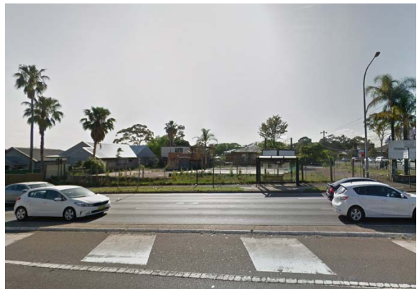
View of empty lot opposite the site on Woodville Road