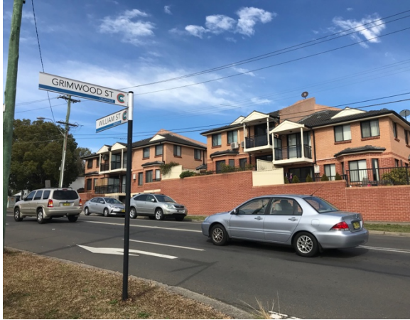
Multi-storey medium density residential blocks on William St