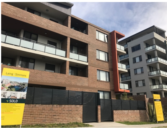
Multi-storey medium density apartment development on Railway Terrace, Merrylands