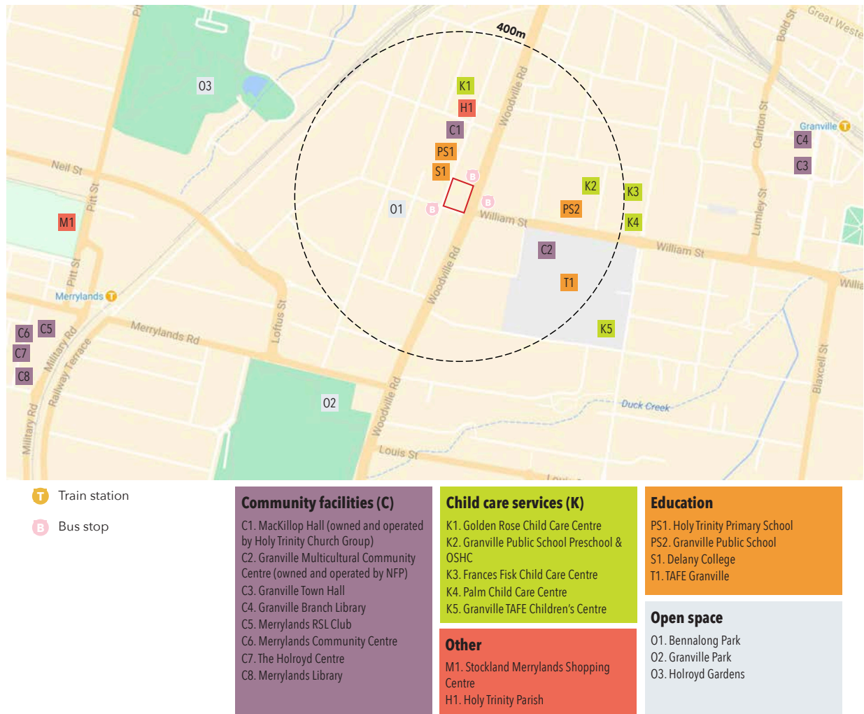
Figure 6 Social infrastructure and open space within 400m of the site