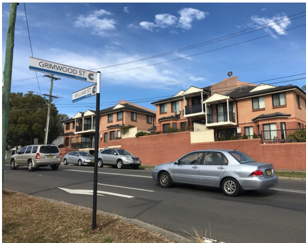
Two story residential blocks directly opposite the site on William Street