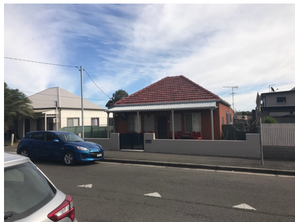
One-storey residential cottage dwellings on Grimwood St