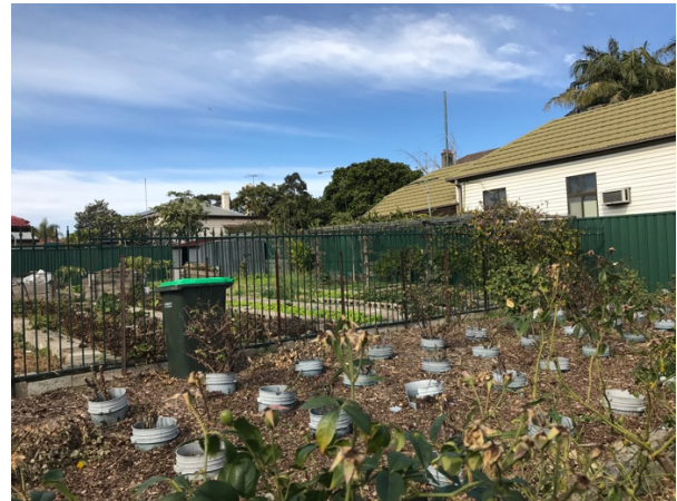
View of the vegetable garden