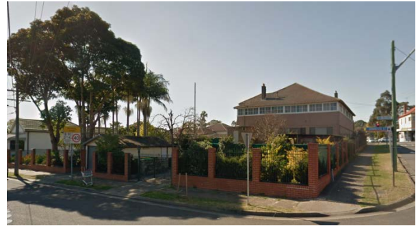
View of site from corner William St / Grimwood St