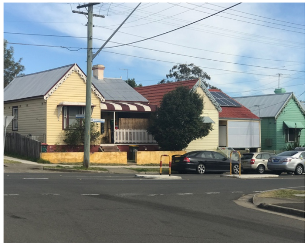
One-story residential dwellings opposite the site on Grimwood Road