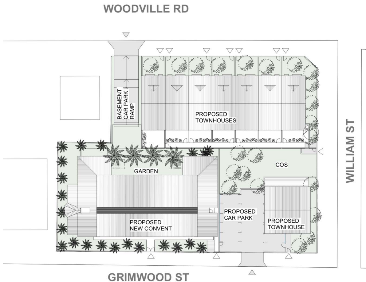
Figure 3 Site plan for proposed redevelopment(source: John O'Brien Architecture)