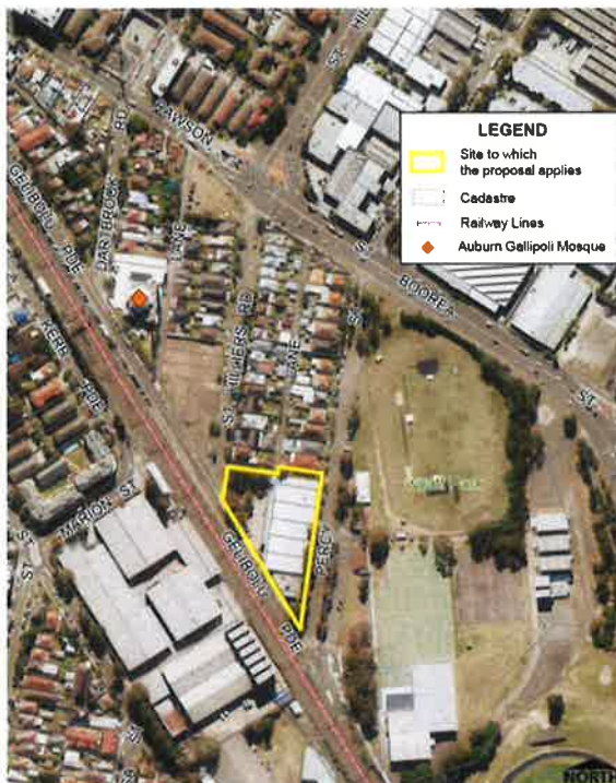
Figure 1- Subject site

The site has been used for various industrial purposes since the 1930s. The existing building on the site, currently used by the Master Plumbers and Contractors Association of NSW, is proposed to be adapted for use as a (K-12) school, including a small addition to the roof (cafeteria and toilets).