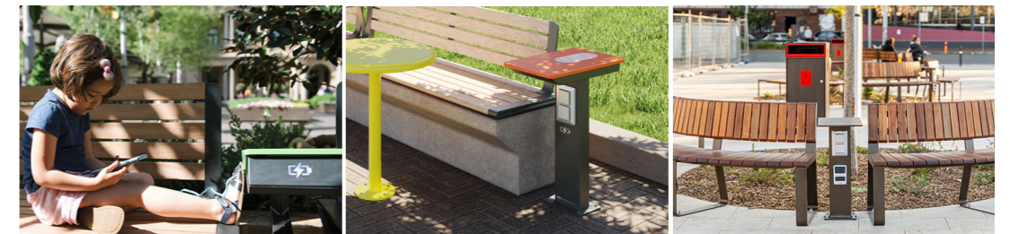
Smart bench device integrated with seating