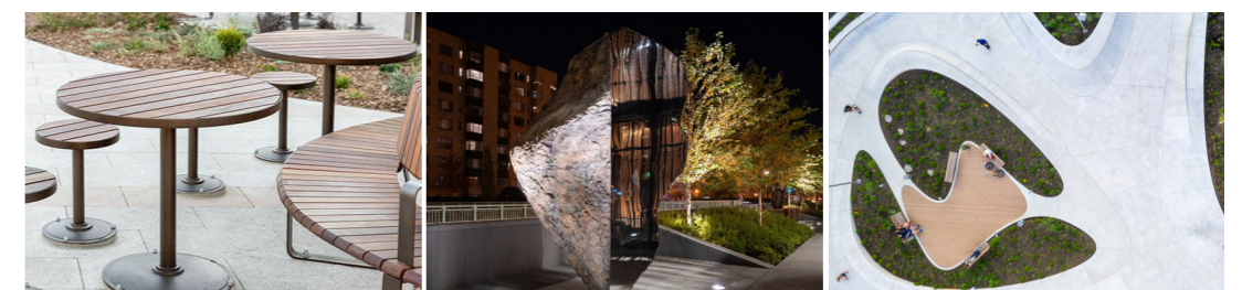
Urban street furniture