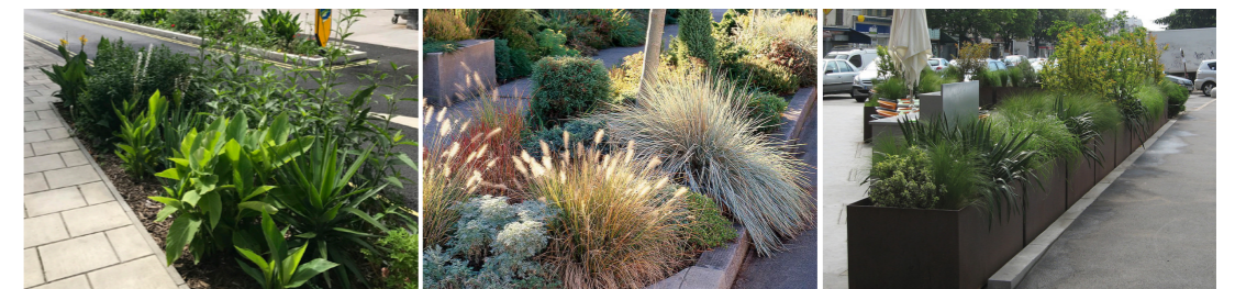
Lush perennial planting and groundcover