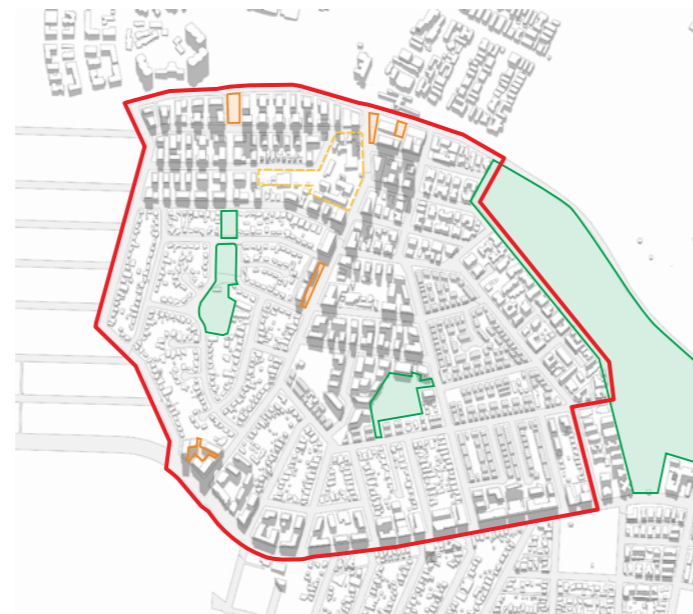
12pm June 21 (Winter)