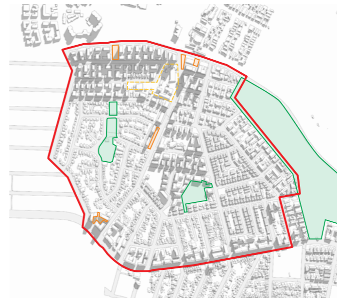
10am June 21 (Winter)