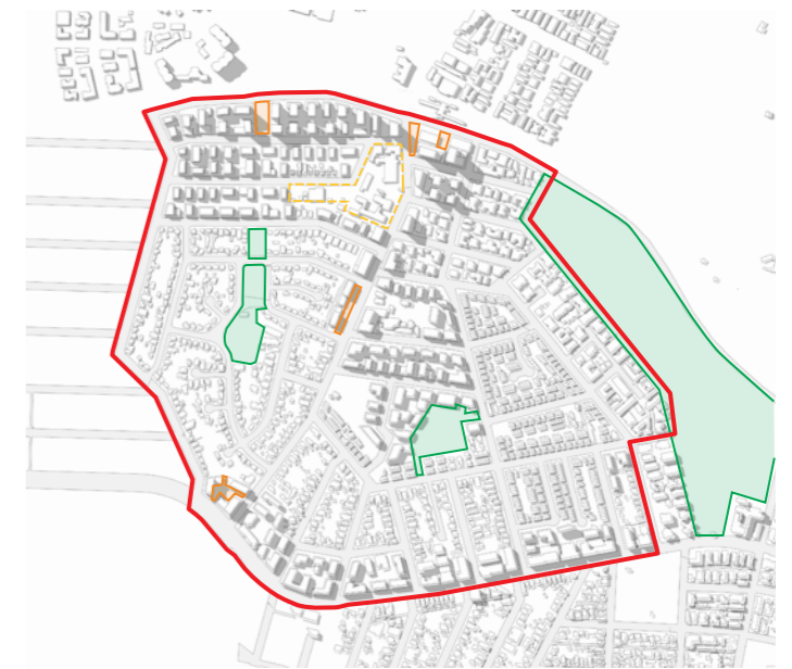
2pm September 21 (Spring)