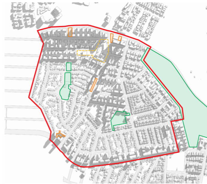
9am June 21 (Winter)

Most streets remain sunny during the day. The area with the greatest impact is at the northwest of the precinct and at the northern end of Hawkesbury Road where the highest density is proposed. Further solar analysis would be required on a site by site basis at DA stage to understand the solar impact in more detail.