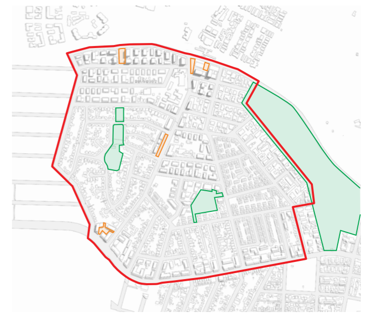
11am December 21 (Summer)