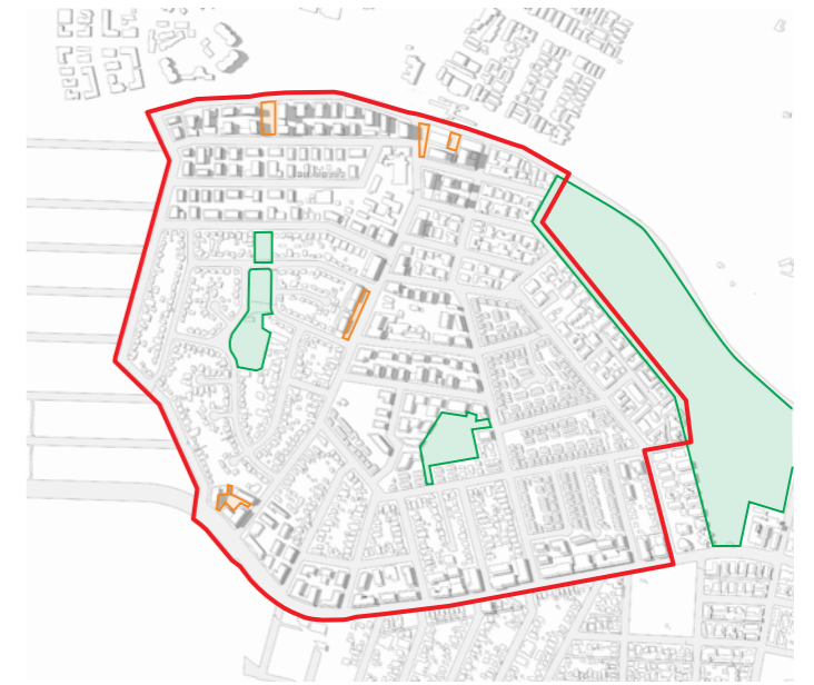
2pm December 21 (Summer)