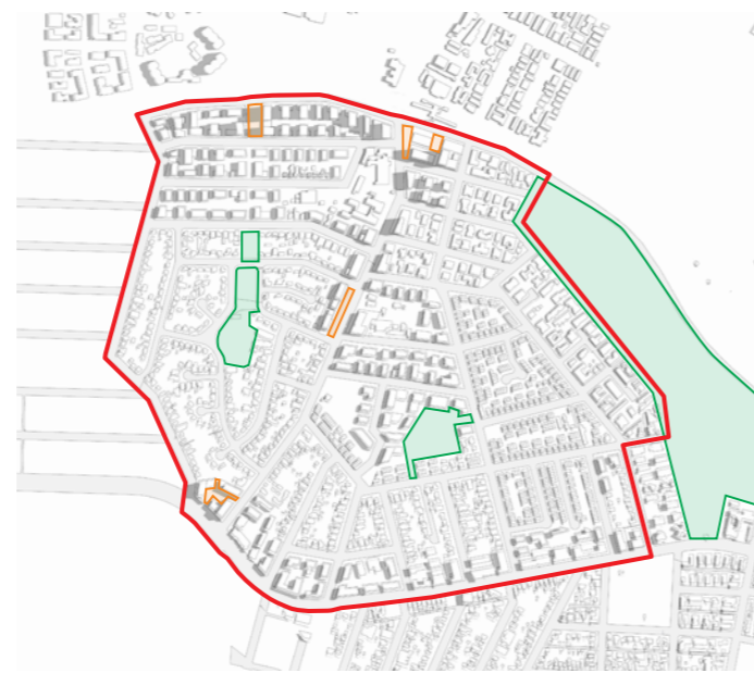
9am December 21 (Summer)

Further solar analysis would be required on a site by site basis at DA stage to understand the solar impact in more detail.