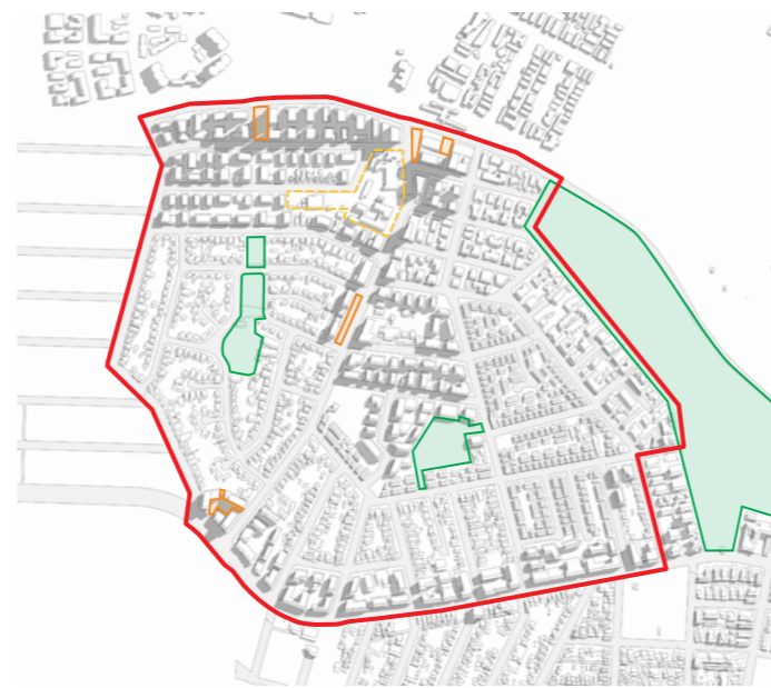
9am September 21 (Spring)

Further solar analysis would be required on a site by site basis at DA stage to understand the solar impact in more detail.