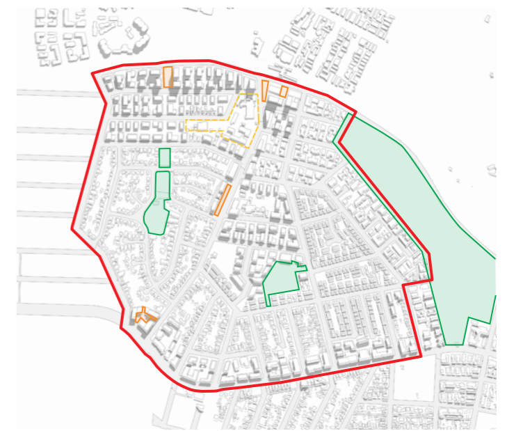
11am September 21 (Spring)