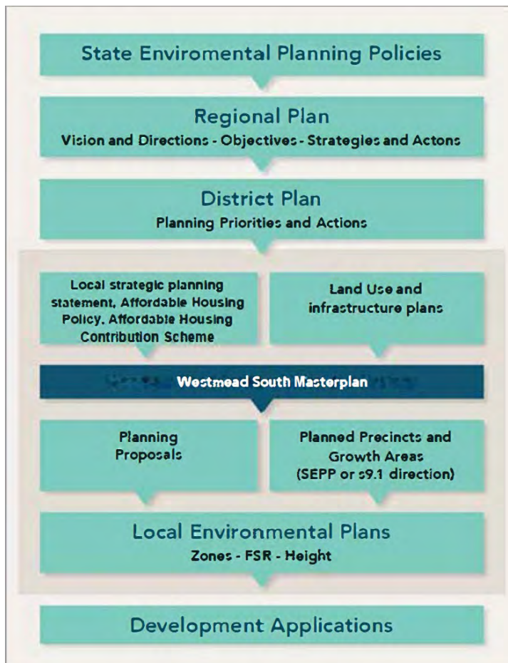
Figure 1: Context of the Affordable Housing Contribution Scheme