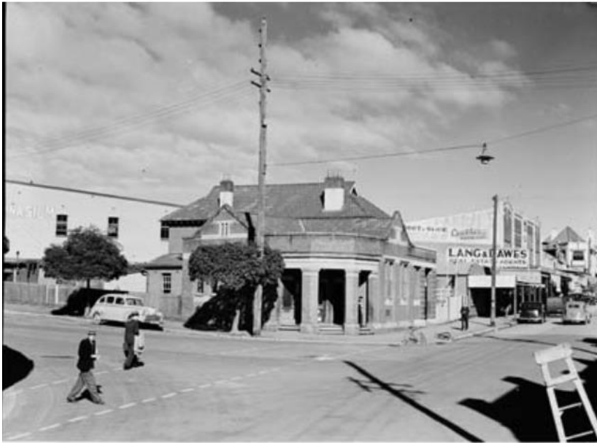
Auburn Post Office 1947