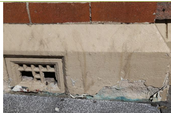
Detail to damage caused to sandstone footings by acrylic paint. Not also damage to vent.