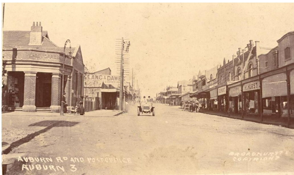
View along Auburn Road c.1912-1920, showing Auburn Post Office (left) as it originally stood