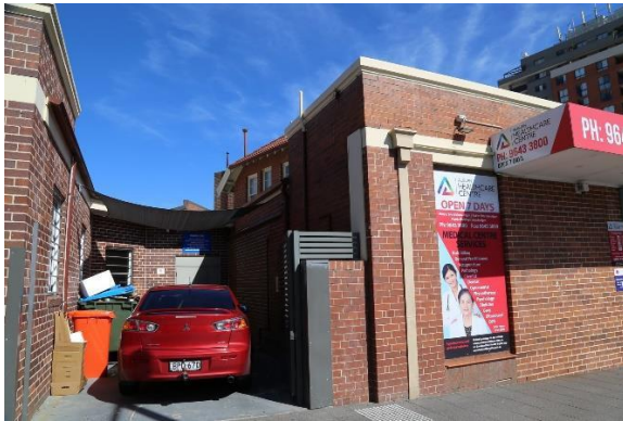
View to rear of Post Office along Kerr parade showing rear extension.