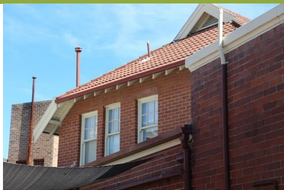
View to upper level of post office.