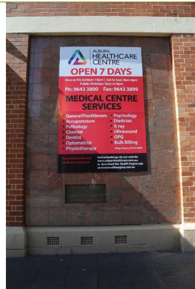
Overview of stone wall with foundation stone inset at the lower section.