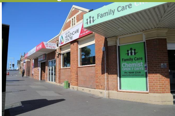
View along elevation fronting Kerr Street.