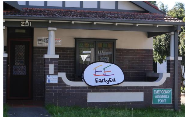
Detail of verandah.