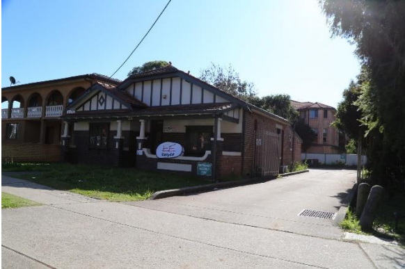
Overview of bungalow.