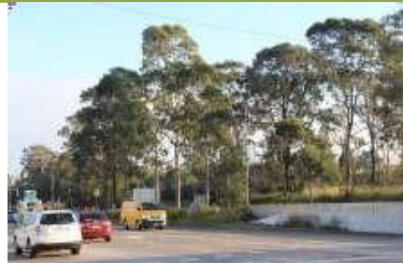
View of the trees from Parramatta Road.