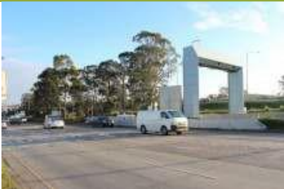
View of the trees from Parramatta Road.