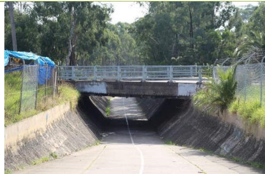
View to footbridge over the Lower Prospect Canal.