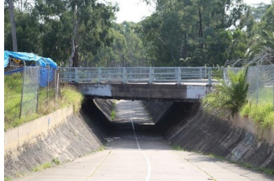
View to footbridge over the Lower Prospect Canal.