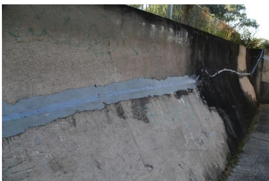
View to cracking of wall at Boothtown Aqueduct.