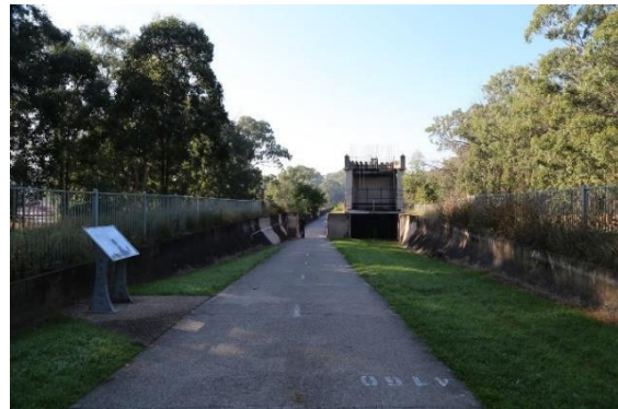
View along the Boothtown Aqueduct showing the Boothtown Syphon in the background.