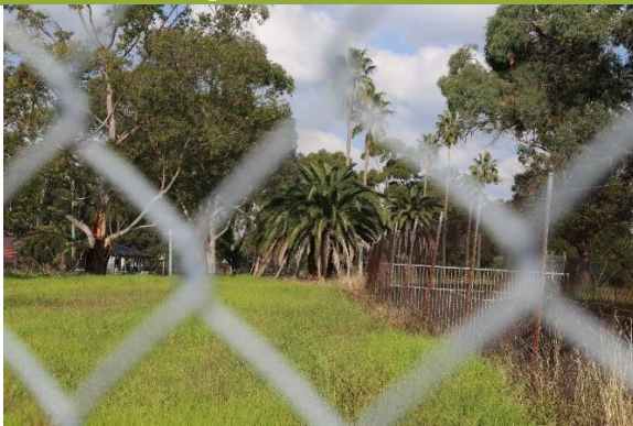
View towards landscape surrounding Boothtown aqueduct and Aqueduct Valve House No. 1 and No. 2.