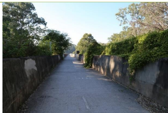
The Boothtown Aqueduct.