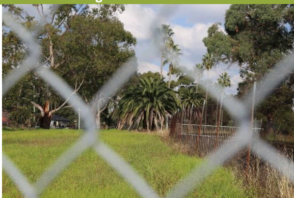
View towards landscape surrounding Boothtown aqueduct and Aqueduct Valve House No. 1 and No. 2.