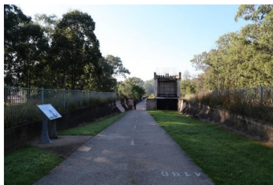
View along the Boothtown Aqueduct showing the Boothtown Syphon in the background.