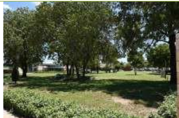
Overview of memorial.