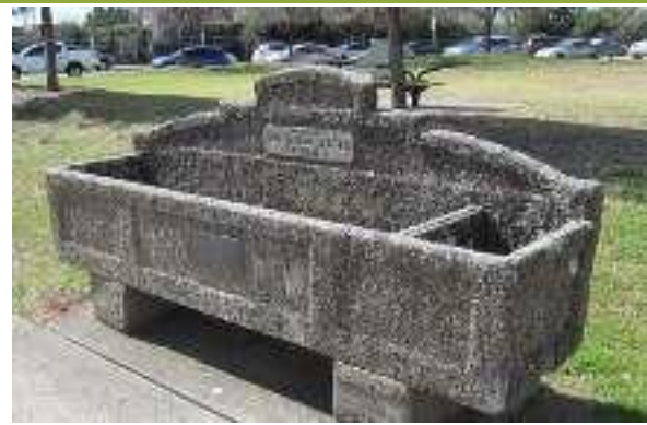
View to Horse trough.