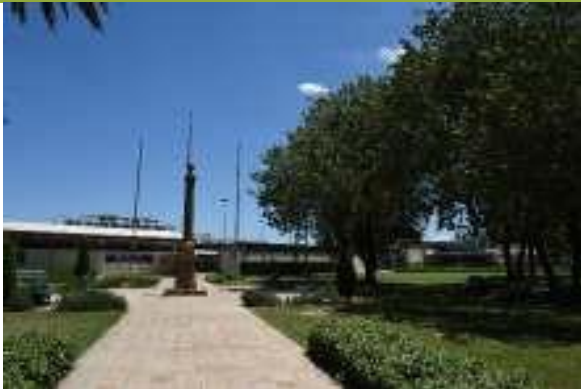
View to memorial.