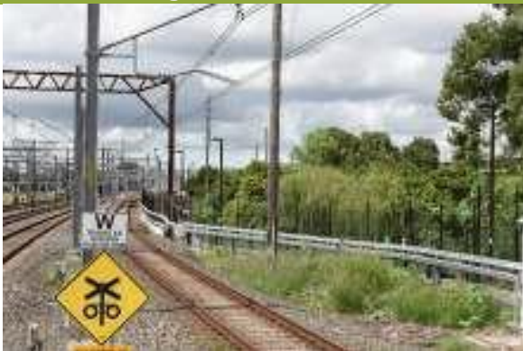
View of Clyde Marshalling Yards.