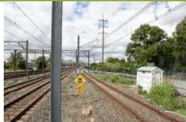
Overview of Clyde Marshalling Yards.