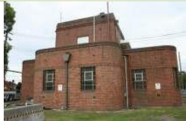
View to Clyde Signal Box.