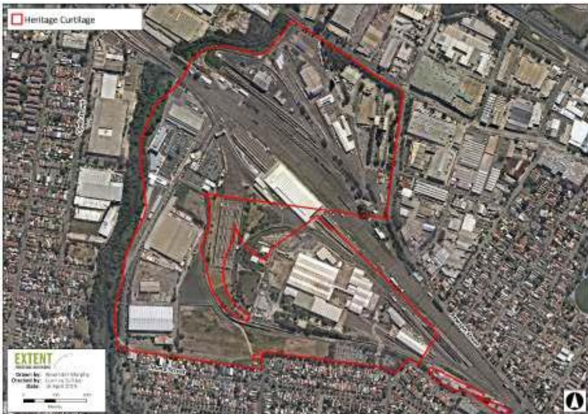
Revised Curtilage recommended - refer below.