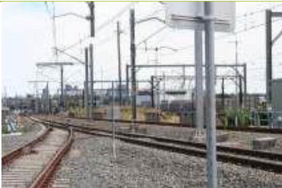
View to siding at Clyde Marshalling Yard.