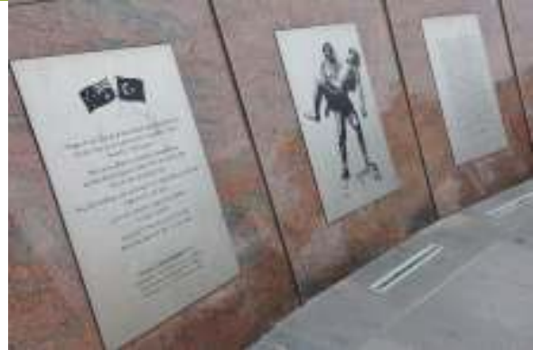
Detail of memorial plaque with a poem by Mustafa Kemal Atatürk.