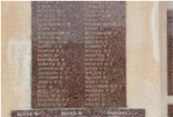
Detail of memorial plaque with names listed.