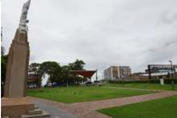
Facing south-west, context of memorial within park landscape.