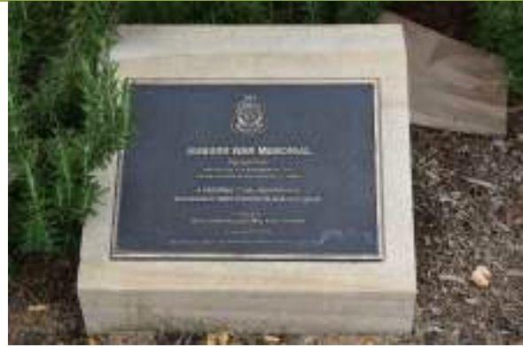
Detail of 2015 plaque, a memorial to 'all Australians who served their country in war and peace'