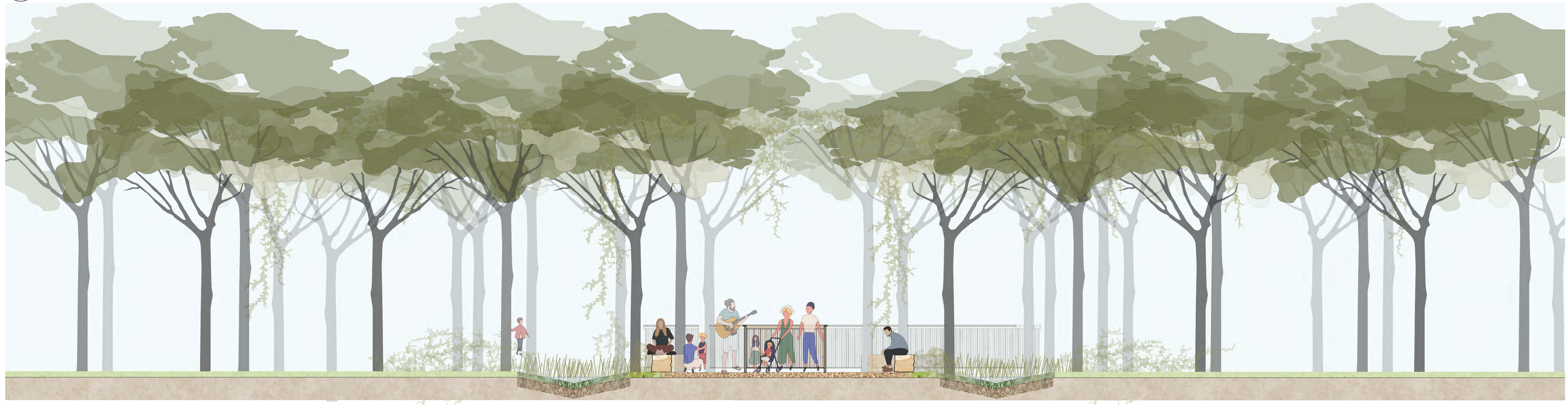
2 Cross Section B - B Scale: 1:50

MCGREGOR COXALL © Copyright McGregor Coxall AUS ACN 082 334 290 UK 10199853 PRC ID NO. 0600002201607080008 Sydney Melbourne Shenzhen Bristol www.mcgregorcoxall.com