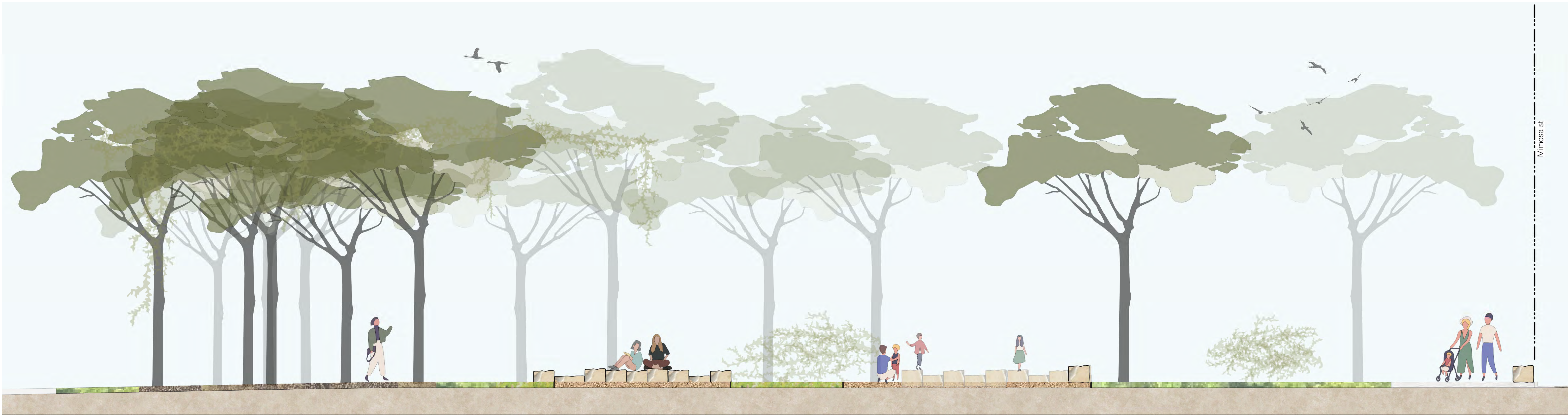
1 Long Section A - A Scale: 1:50