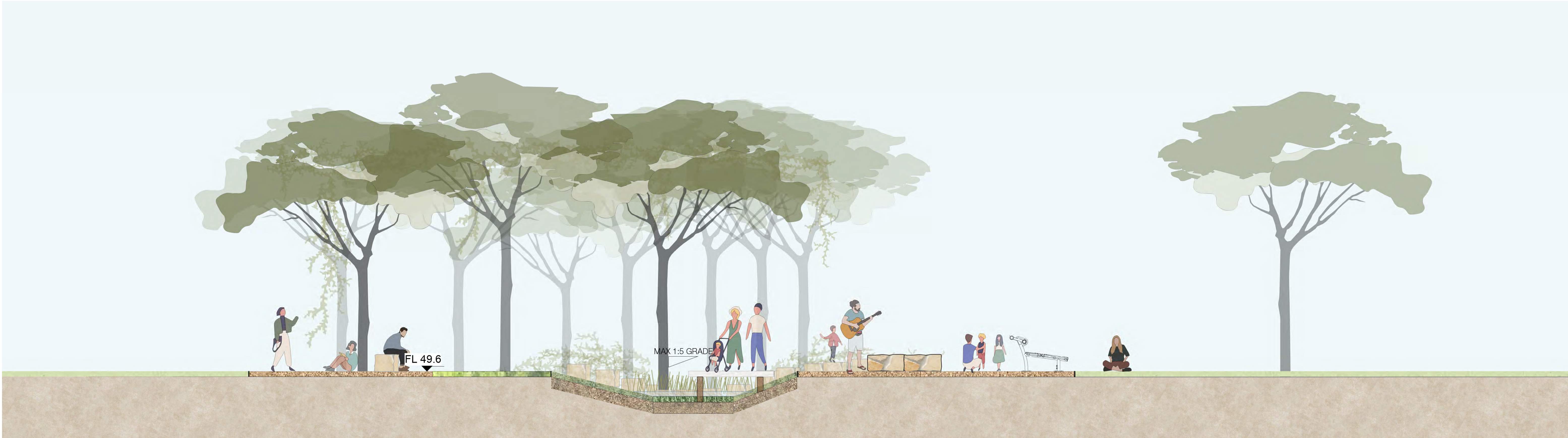
2 Cross Section B - B Scale: 1:50