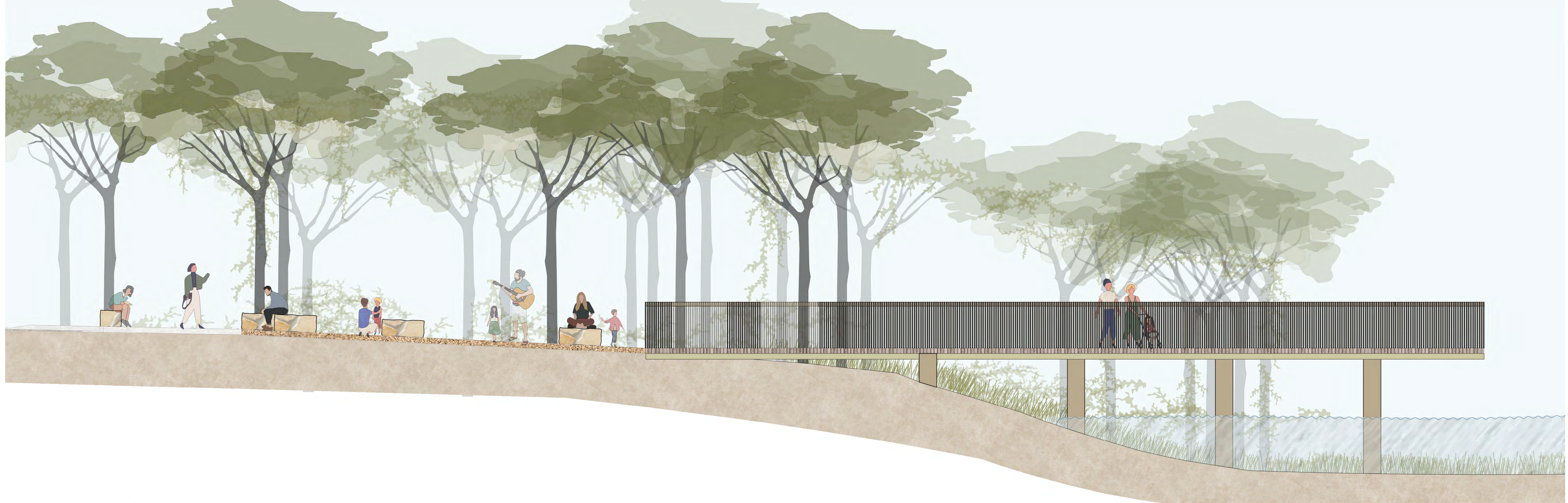
1 Long Section A - A Scale: 1:50