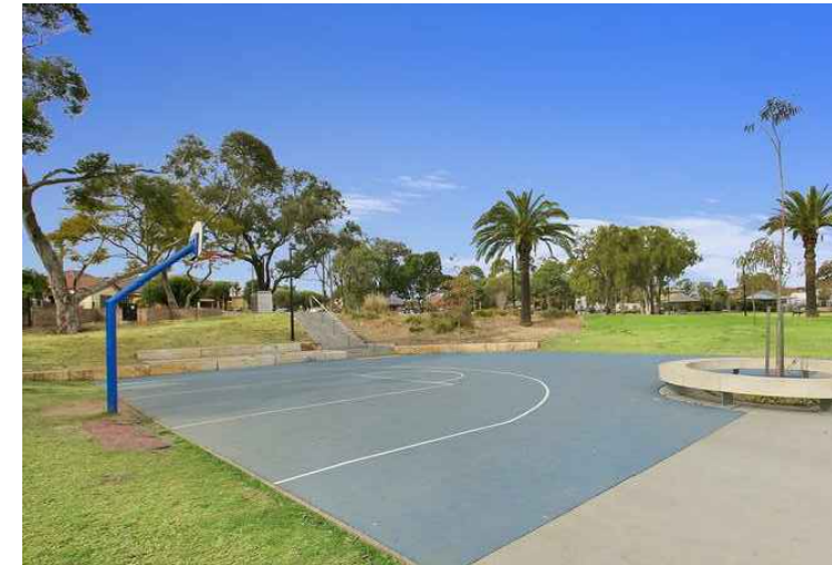
3 Existing Site Photo NTS