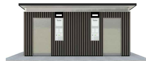
2 Indicative 3D Perspective NTS

NOTE: INDICATIVE PLAN ONLY SUBJECT TO PLANNING AND DESIGN