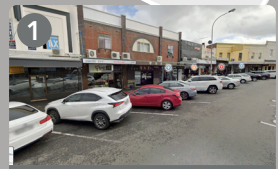
Lidcombe Station Town Centre

Pippita Station Pippita Station was a former railway station on the former Abattoirs Line in Sydney. The station opened on 4 October 1940, closed on 20 October 1995 and was demolished in 1996.