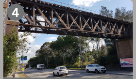
Bridge over Parramatta Road