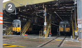
Flemington Maintenance Centre