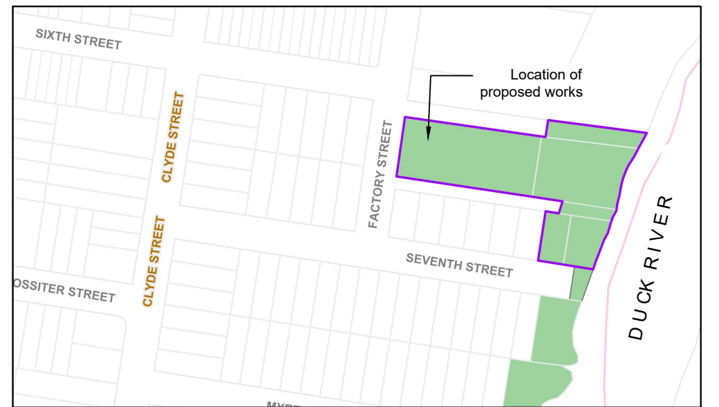
2 Location Plan NTS