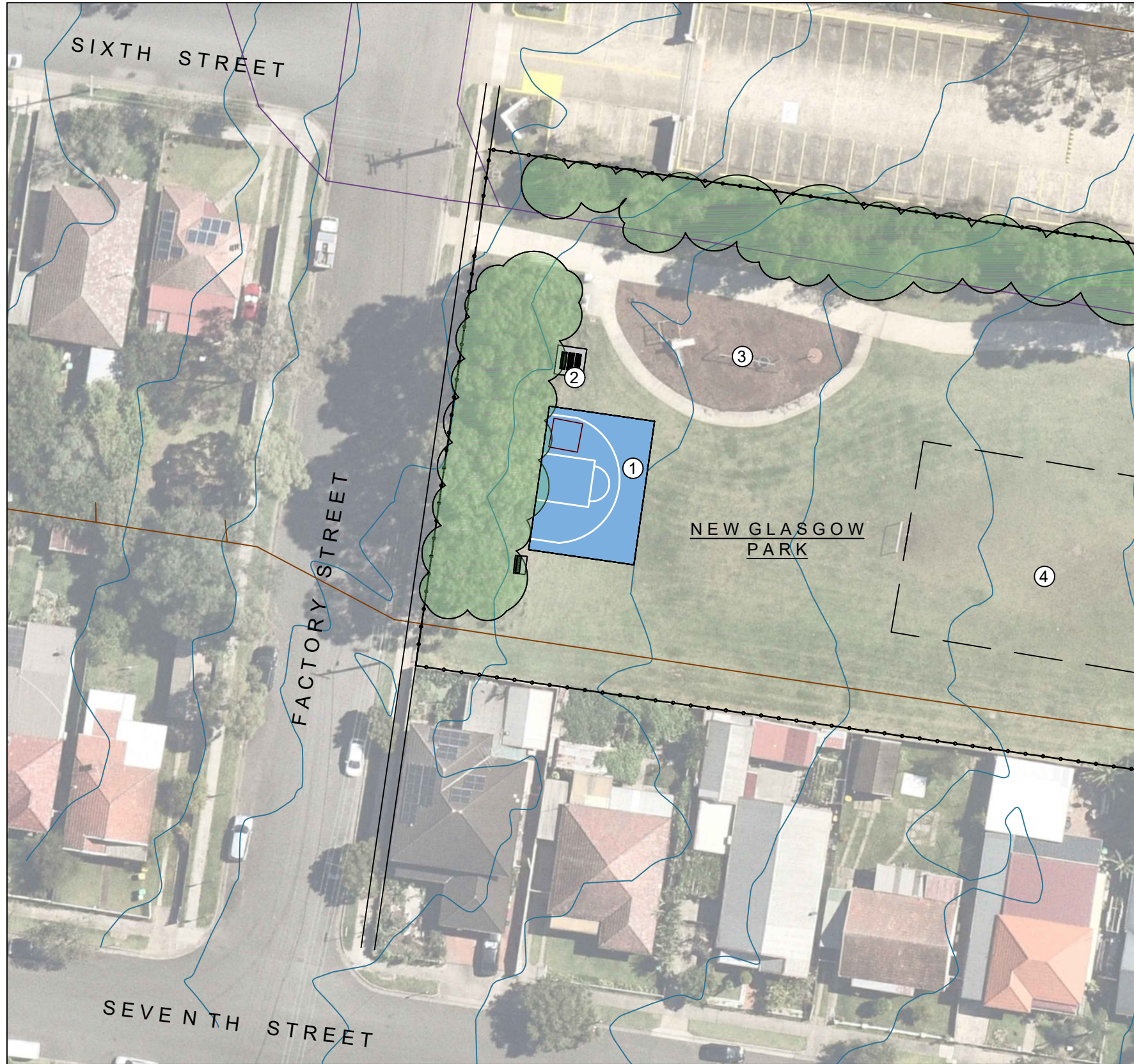
1 Concept Plan Scale 1:500